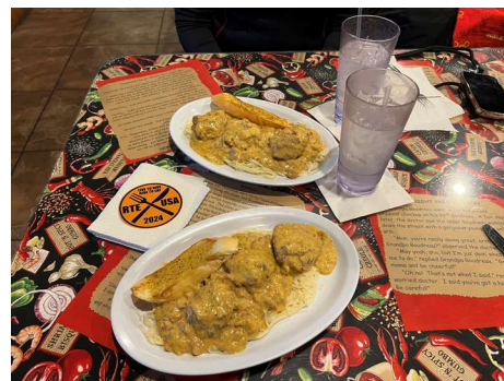
Boudreau & Thibodeau's Special

Karen started off with a cup of seafood gumbo while I had a half-dozen charbroiled oysters. Then, we both ordered the Boudreau & Thibodeau's Special; Shrimp and crab meat rolled in batter and deep-fried over a bed of angel hair pasta, covered in a crawfish sauce. Absolutely incredible!