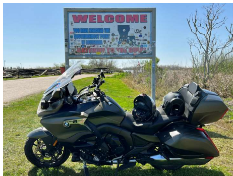
Most Southern Point in LA

the end of the Mississippi River meets the Gulf of Mexico.