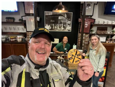
We'll see these Hostess' in Oct.

The sky was clear with a bright full moon as we headed north on I-55. The temperature was very pleasant until we got through Jackson, MS.